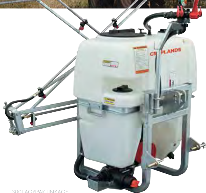
300L AGRIPAK LINKAGE WITH BOOM