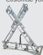
8 TO 12M BOOM OPTIONS

Customise your Croplands TrailPak sprayer with hose reels, boom sizes, fence line kits, chemical mixers, auto rate controllers and GPS guidance to name a few.