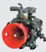
AR140LFP-C POLY PUMP