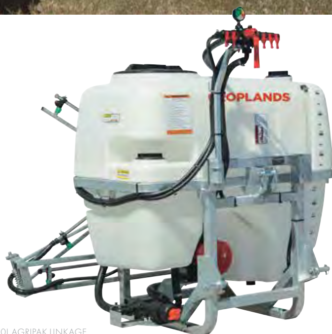
600L AGRIPAK LINKAGE WITH BOOM